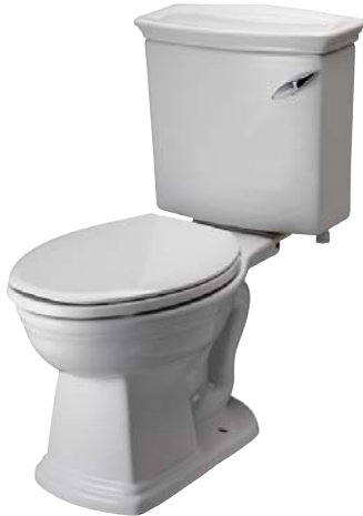
Seat NOT included